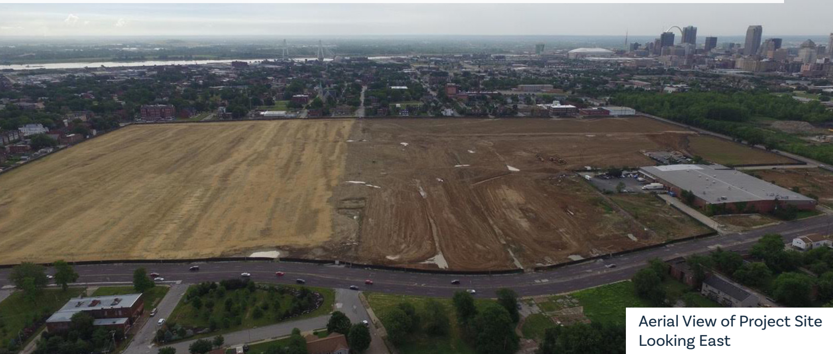
Aerial View of Project Site Looking East

This is your Next NGA West In Your Community Newsletter - Issue #2